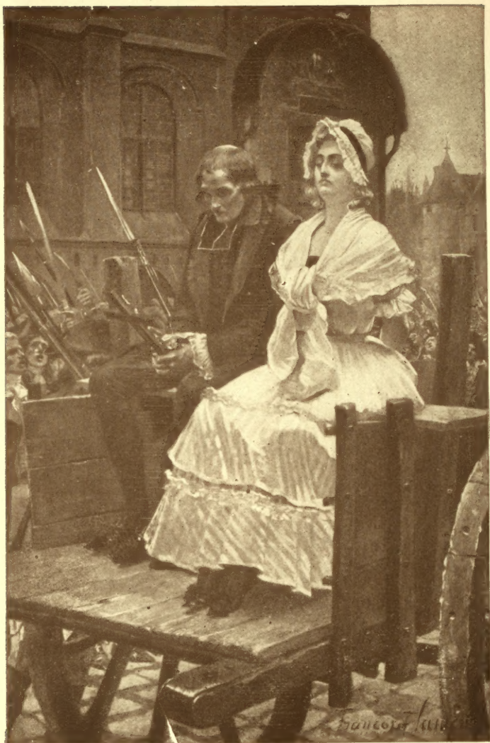
Marie Antoinette on the way to her execution From the painting by Francois Flameng